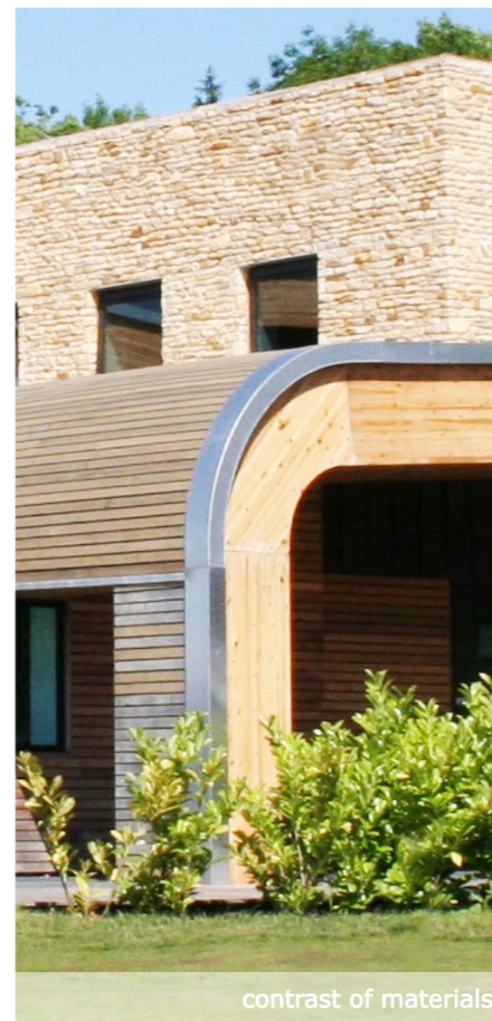
contrast of materials