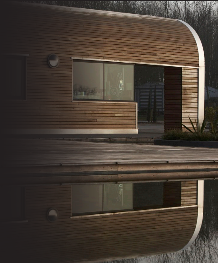
partial view of the glasshouse

The distinctive design of the lodges has ensured there success as holiday accommodation with high levels of demand which was the aim of the business plan.